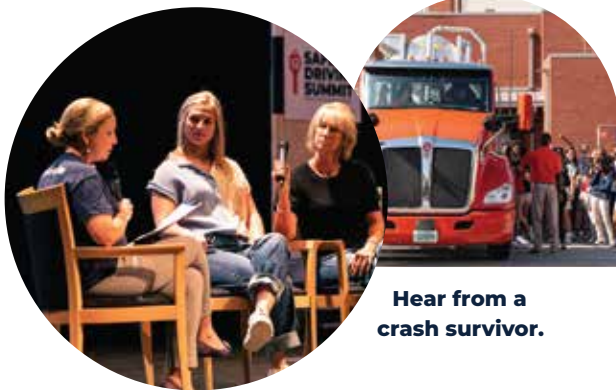
Hear from a crash survivor.